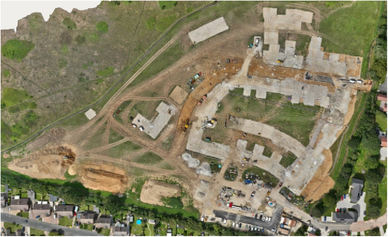
Figure 3—Aerial view of site taken first week in August.