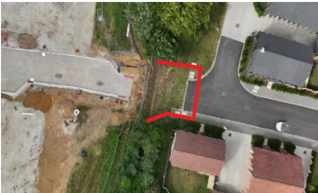
Figure 2. Red line denotes temporary re-route

I would really appreciate some feedback on the additional timber that we've installed on the bollards to try and negate anyone driving through. Let us not forget though, that the bollards will be removed in line with what has been agreed with planning.